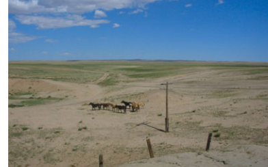
The Gobi Desert