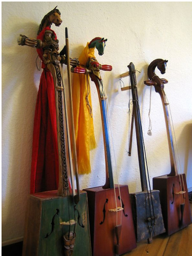
Horse head Violin

The “horse head violin” is one of the most popular instruments in Mongolia. It is an instrument with only two strings. It sounds similar to the common violin. Mongolians play it on many occasions, such as dances or special celebrations.