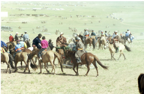
Horse Races

Genghis Khan is long dead and his world empire has gone down. However, wrestling, archery and horse races are considered the most important sports in Mongolia. At the Nadaam festival, which is the Mongolian public holiday, Mongolians compete in those sports - like athletes do at the Olympic Games. Every year, from July 11th to the 13th, Mongolians celebrate the Nadaam festival. Horse races are the special highlight of the festival. Families start preparing for the races many weeks in advance. Often children (especially girls) between the ages of 6 and 12 participate as jockeys. At the end of every race, there is an award for the fastest horse and the horse's breeder.