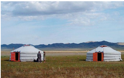
Yurts in Mongolia

From the outside, yurts are similar to big tents. But inside they are as cosy as a house! A typical yurt consists of a scaffold (5 pieces) and other parts to build the roof. In order to give the yurt a wall and protect the people inside from bad weather, several layers of sheep wool and felt are attached to the scaffold. Inside the yurt, you can find some furniture and even a stove. There is no running water though. Within two hours, yurts can be set up or taken down and the nomad family can move on to another place.