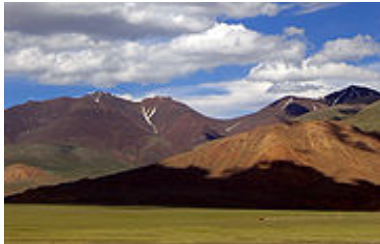
Mongolian landscape

There are many mountain ranges in Mongolia with mountains higher than 4000 metres. But Mongolia is also known for its steppe and desert regions. The largest desert region in Asia is called “Gobi” and covers parts of southern Mongolia. The Gobi Desert is the fifth largest desert in the world.