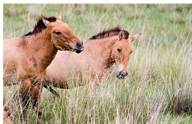
Wild Horses